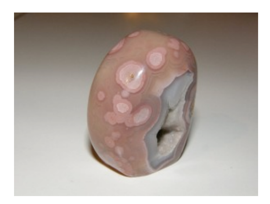
Showing the edge