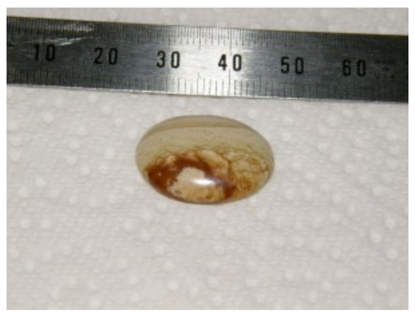
Jasper - I love these with the orbs!