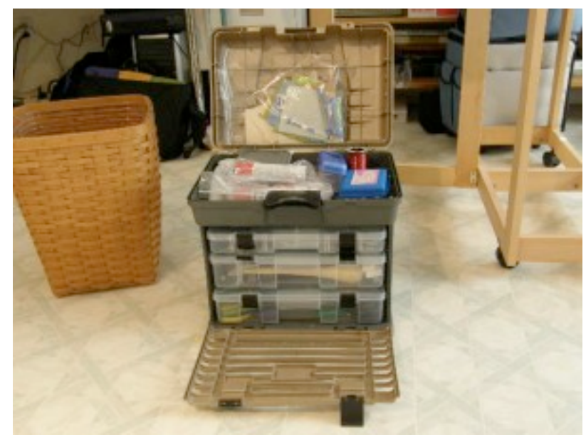
The table, cleared of sewing, with the paper laid down and taped.