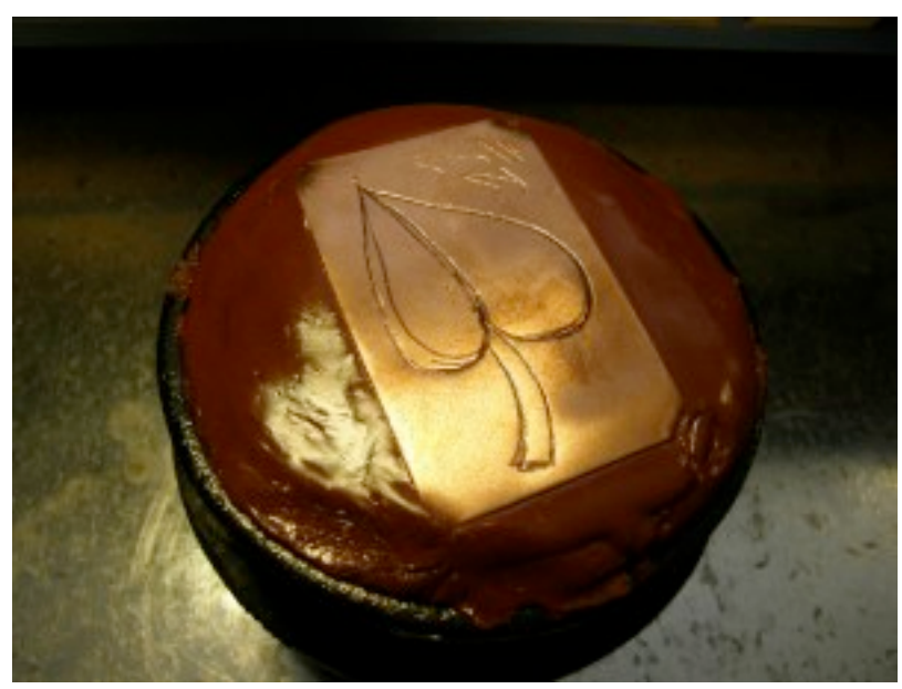
In the pitch pot - backside up for doing repousse