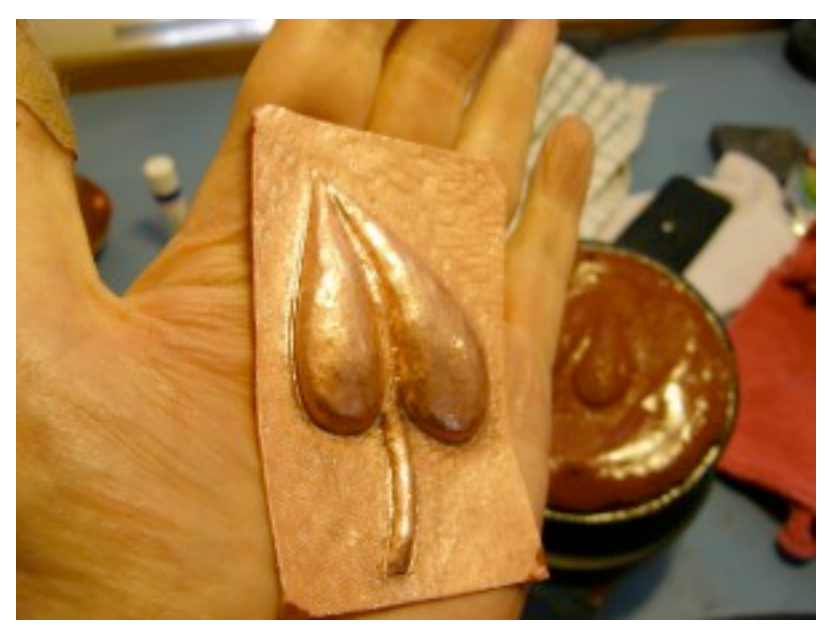
For additional pictures look at this <u>flickr</u> photo stream from fellow student Elizabeth (how cold is it in Ohio today?)