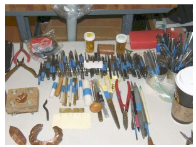
In the pot and marked with the lining has been completed