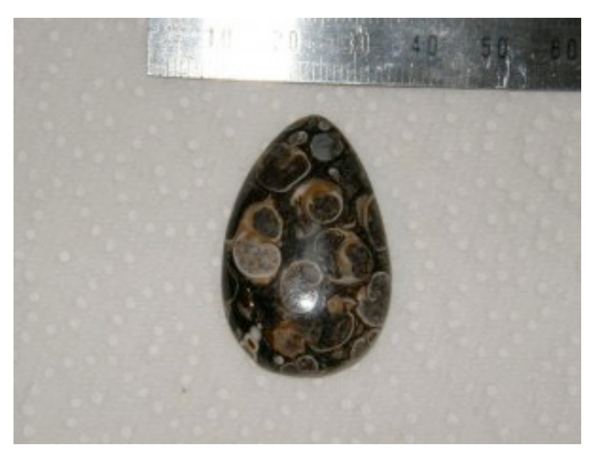
A larger Picture Jasper