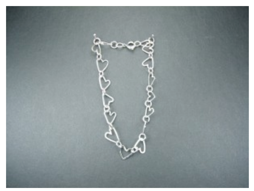
The Adventurous Silversmith Blog History Blogging for those who aspire to be a silversmith

I have now made and either given them as presents or sold 5. I have taken the idea and made earrings and I have made a larger necklace/chain.