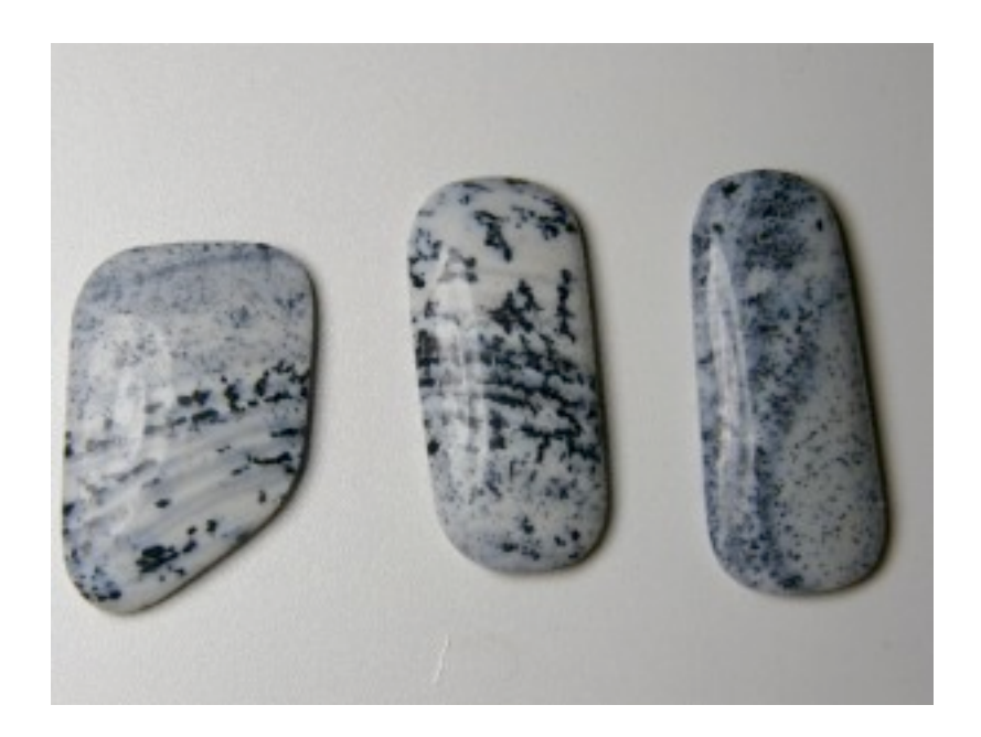
The Adventurous Silversmith Blog History Blogging for those who aspire to be a silversmith

I picked up a rather nice, large slab of Moss (Plume) Agate. I made one, wire wrapped it and sent it a friend (picture to follow in another post. From the remaining I made these two and the next one called the Arrowhead.