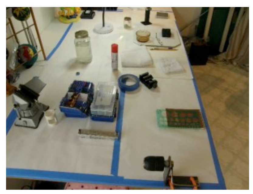
Bench Block and Hammers to my right