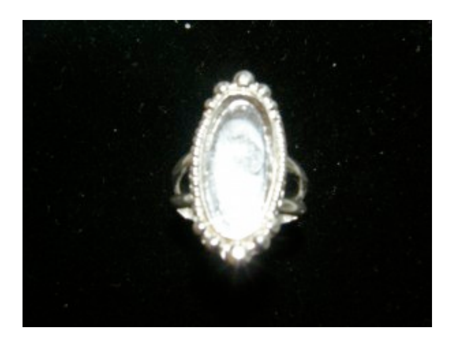
The Adventurous Silversmith Blog History Blogging for those who aspire to be a silversmith

On Tuesday evening, I was ready to mount the stone. And then... we noticed I had missed soldering down one of the arms on the shank. D!@*n !!!!! Back into my office and I had it soldered in less than 5 minutes but it was then time for another round of pickle and tumbling