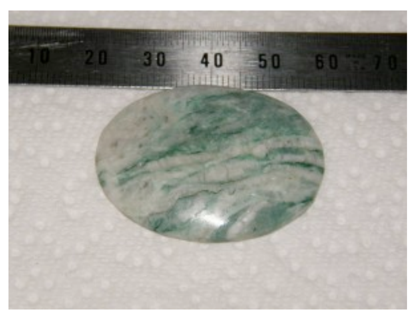
A tiny picture jasper.