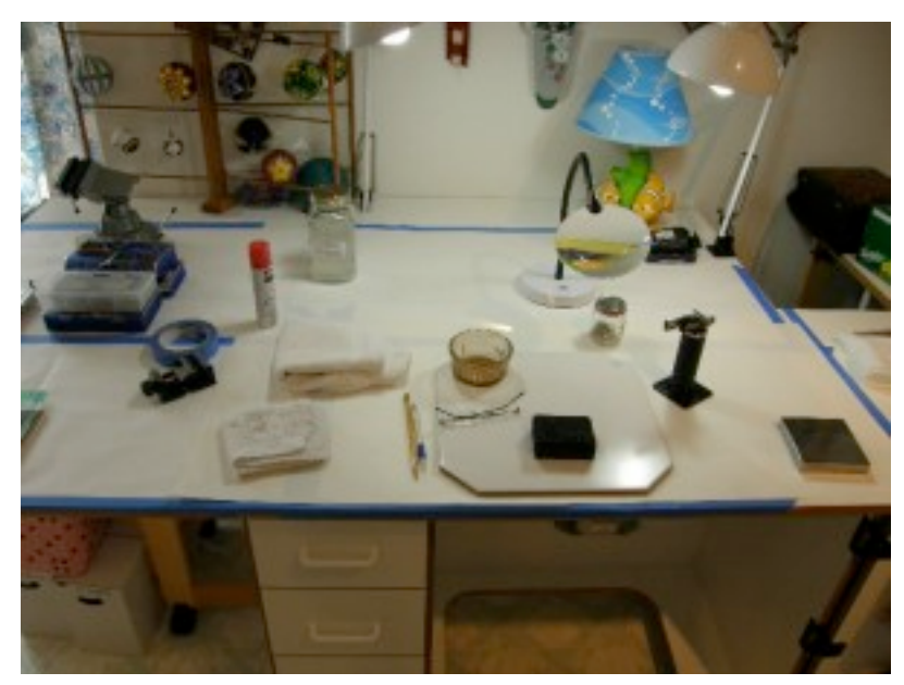
Looking across the table from the left, coil winder in the front