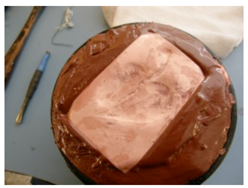
Turned and ready for chasing