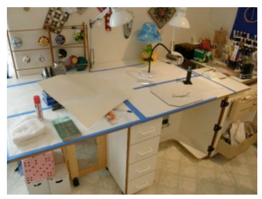
The soldering station with tile, water, torch. Vice and dremel tools to the left