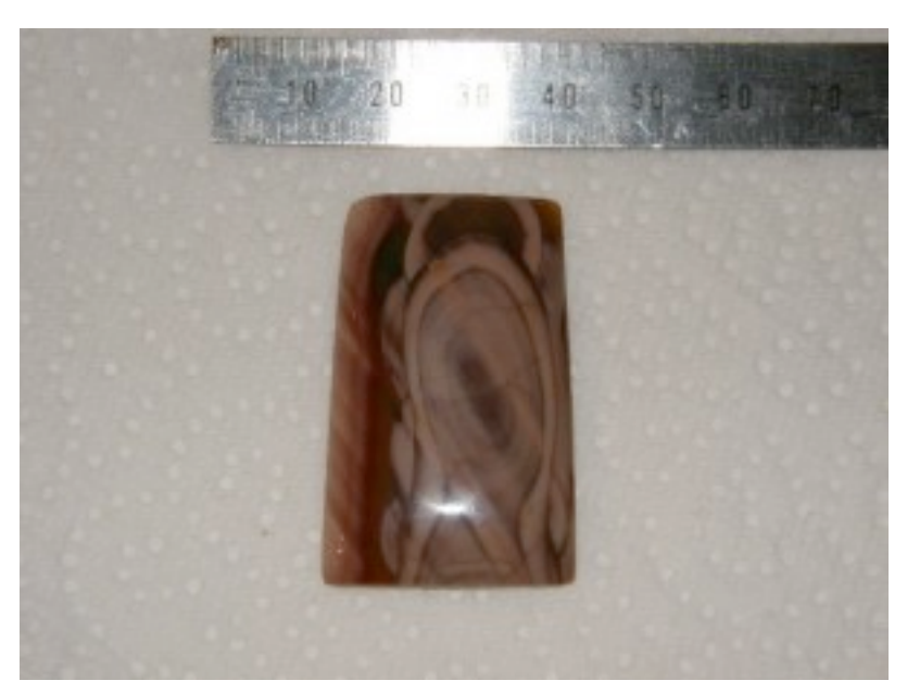
Crazy Lace Agate