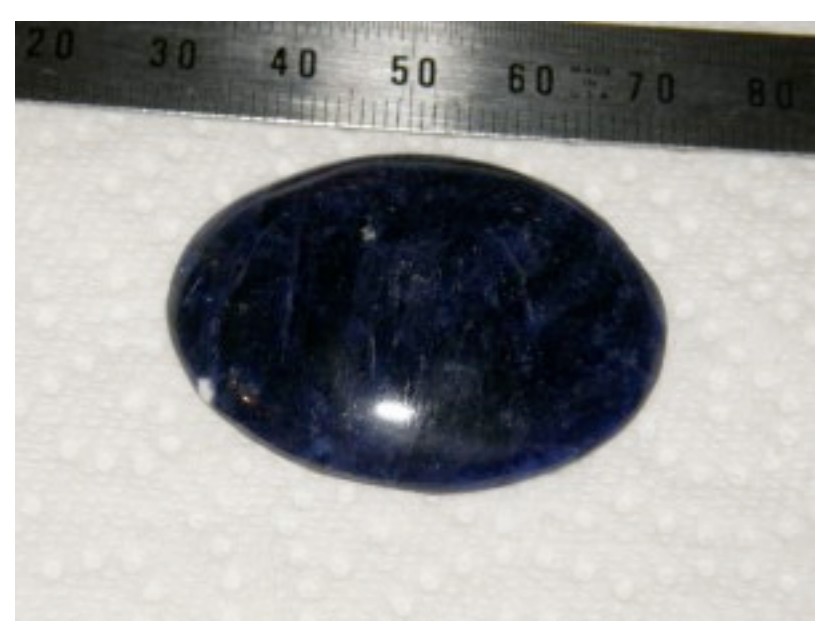
Crazy Lace Agate