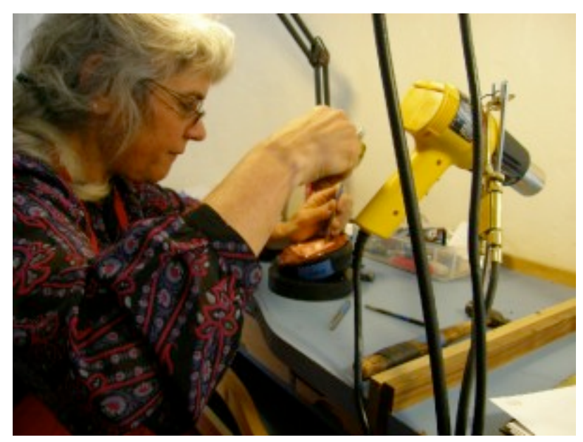
My finished piece!