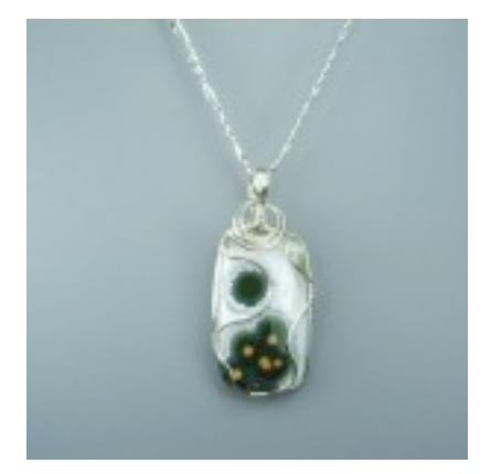
Ocean Jasper Cab set in wire