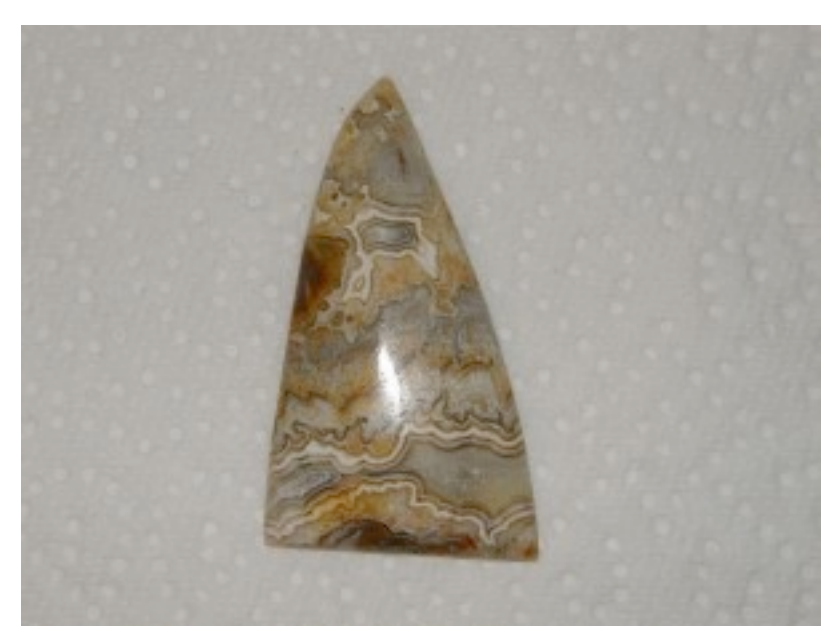
\{1 \text{ comment...}\}