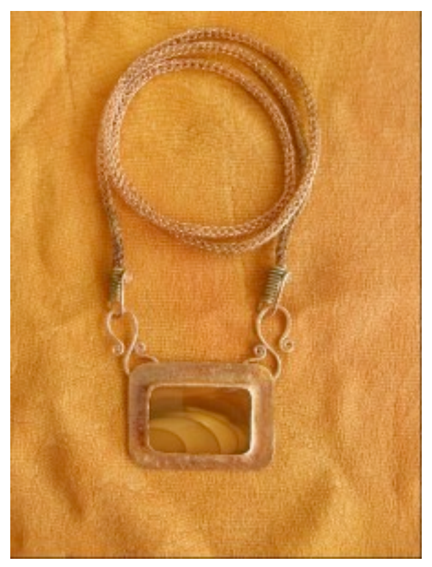
Terri - you asked for it and here it is on my dirty work bench (10:21 pm)