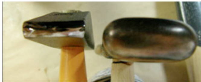
Two Hammer Heads

BTW, I feel better now. You can see the just before and the after picture below.